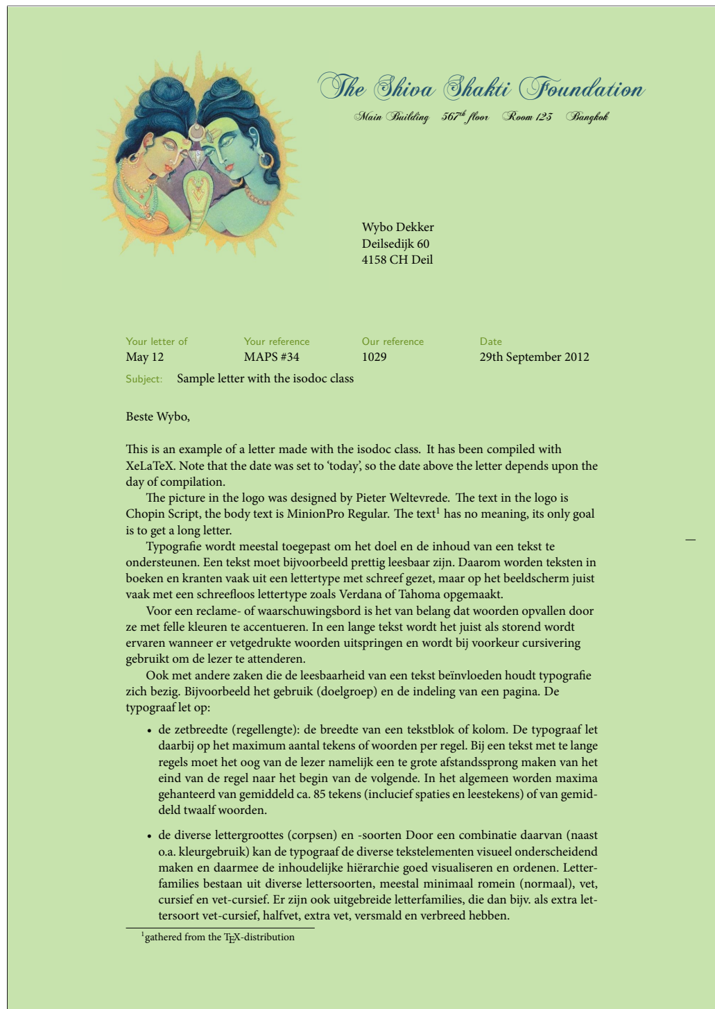
Figure 2: Long letter example with a non-standard logo, page 1